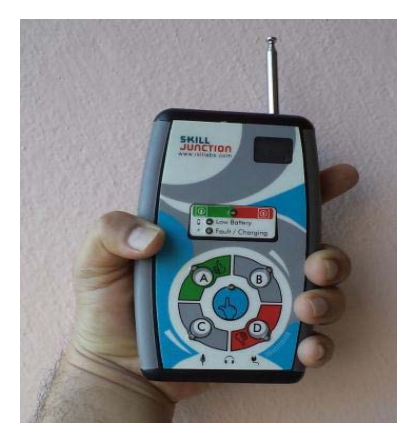
Fig 1: Hand held teacher's interface gadget

Interactive software Integrated learning systems (ISILS) for multimedia content delivery & interaction is a computer controlled electronic device which is required to deliver multimedia content and interact with the users. The infrastructure for multimedia content delivery and a customized lab is also provided. Marketed under the brand name 'Skilljunction,' the interactive software learning and delivery system is available both in online and offline mode. The technology has been made simpler, easy to use and affordable. The handset and teacher's interface is shown in figure 1.